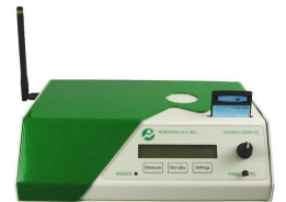
Analog Input/Output 2400R Receiver with 16 (or 32 if upgraded) analog output channels and 8 additional input channels

The top level receiver option is the Analog Input/Output 2400R Receiver . It has the capacity to convert all telemetric data to analog output data, which again can be connected directly to third party devices like 3D motion capture systems. The Analog Input/Output 2400R Receiver includes 8 analog inputs and the standard 16 analog outputs can be upgraded to 32 channels. The Analog Input/Output 2400R Receiver System includes the Wireless Sync-Trigger Kit .