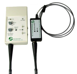
Compact Wireless Sync-Trigger System – compatible with the PC-Interface Receiver.

The stand-alone Wireless Sync-Trigger System upgrades the PC-Interface Receiver and older TeleMyo Systems with a telemetric trigger system. This permits a time-synchronized start of data collection with the TeleMyo 2400T and any third party device in your lab.