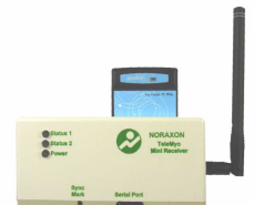
Mini-Receiver with 8 analog input channels

The mid-level receiver model is the Mini-Receiver . It includes 8 additional analog input channels, which are needed for stationary devices like Isokinetics, force and contact plates and light gates. It allows the combination of mobile telemetric data collection with stationary systems without losing the wireless functionality. All data are forwarded to the PC via USB connection. The Mini-Receiver is preconfigured for Wireless synchronization functionality which can be ordered as an extra option ( Wireless Sync-Trigger Kit ).