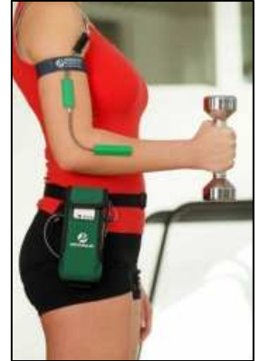
Telemyo G2 transmitter with connected Biometrics 2D Goniometer